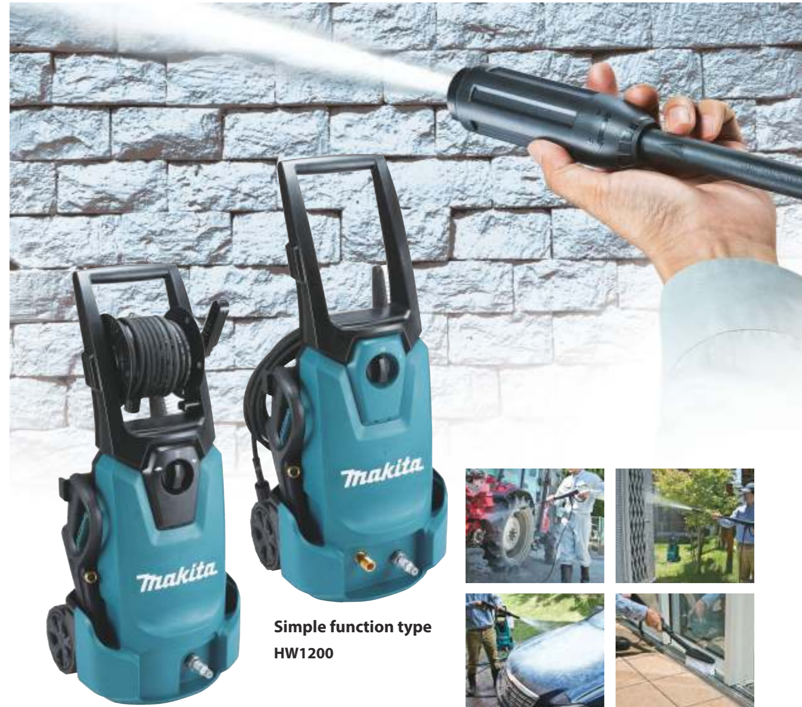
Simple function type HW1200